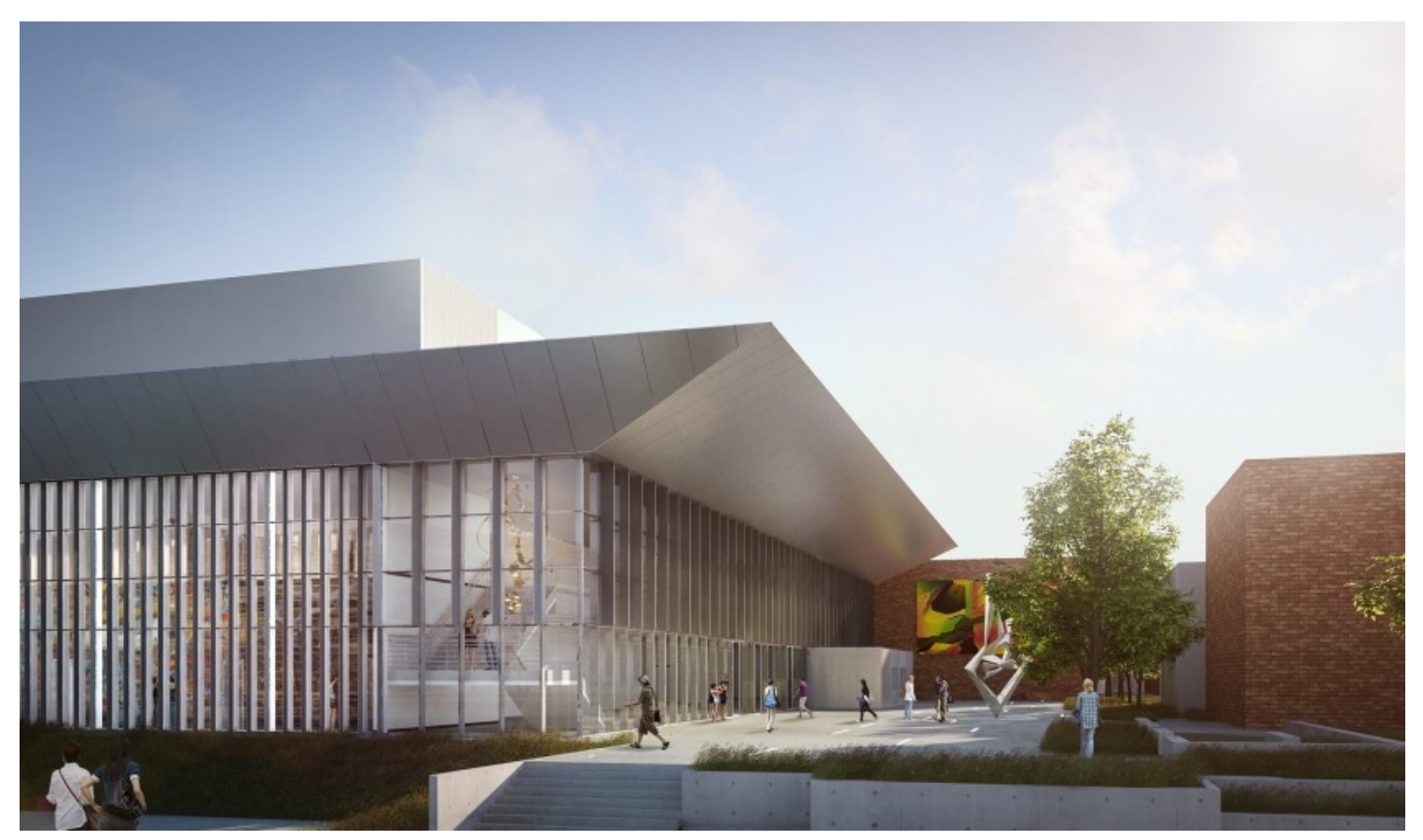
An artist's rendering of the coming Grossmont College Performing and Visual Arts Center, paid for with Proposition V funds passed by East County voters in 2012. (Courtesy art)

Annual report says Prop V funds having positive change on both campuses