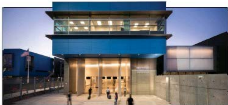
A new processing center greets pedestrians entering the U.S. from Mexico.